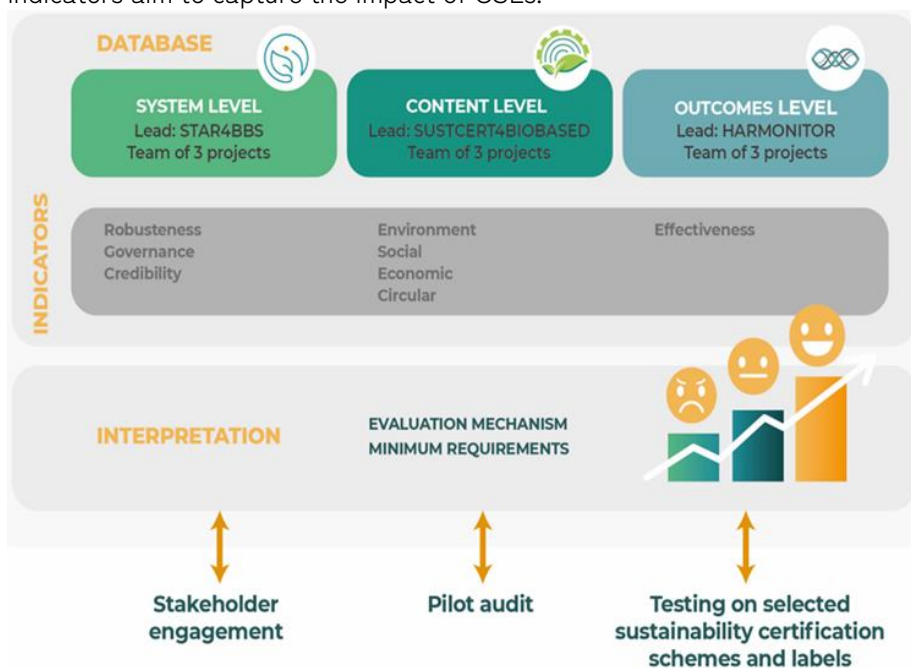
Figure 1: General structure of the BiobasedCert Joint Monitoring System (JMS)

The core principles considered in the development of each level includes rigour, accessibility, efficiency, improvement, transparency, stakeholder engagement and impartiality. Key challenges in developing the JMS discussed between the three BiobasedCert teams developing the JMS include: lack of clarity on legislative requirements; feasibility of setting meaningful minimum requirements; managing continuous improvement between system objectives, and designing a JMS suitable to the diversity of CSLs. 25